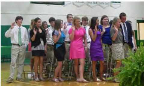
New members repeat the pledge and are sworn in.